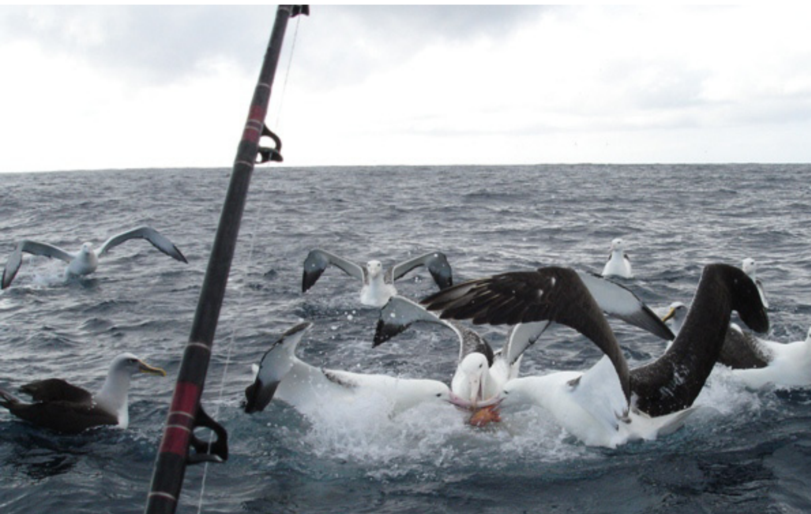
Albatross Dinner Time Dunedin Coast'