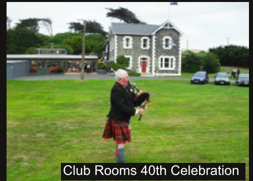
Club Rooms 40th Celebration