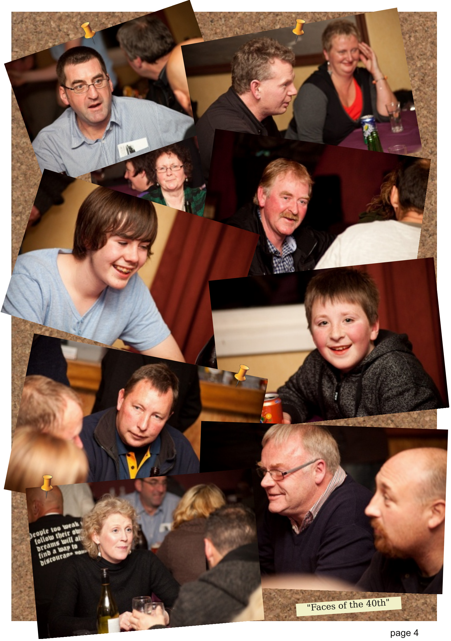
"Faces of the 40th"